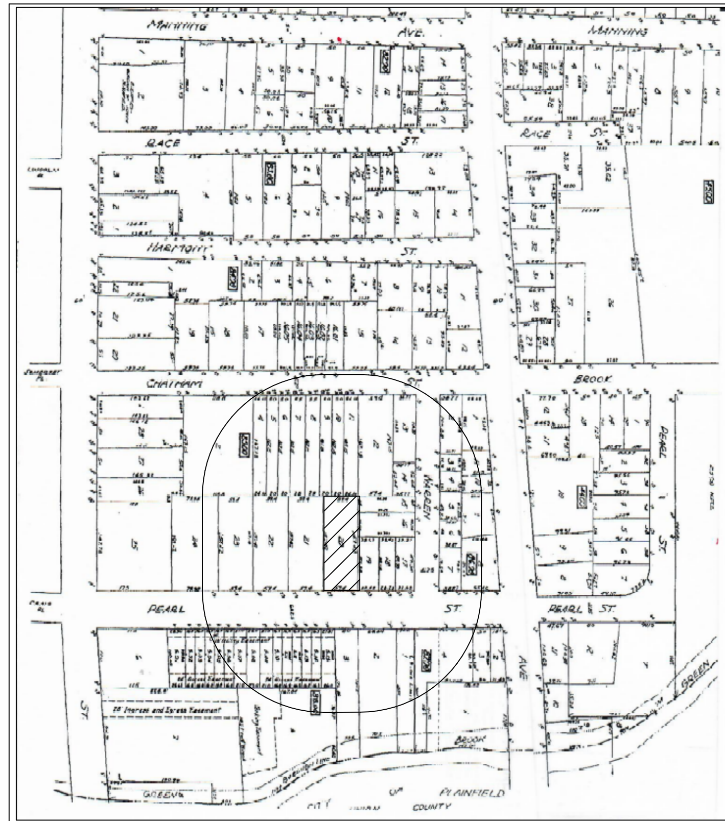
200' RADIUS MAP